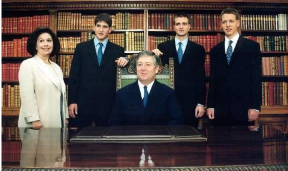
The Royal Family in the King's Office in The Royal Palace Belgrade

From left to right: Their Royal Highnesses Crown Princess Katherine, Prince Alexander, Crown Prince Alexander, Hereditary Prince Peter and Prince Philip