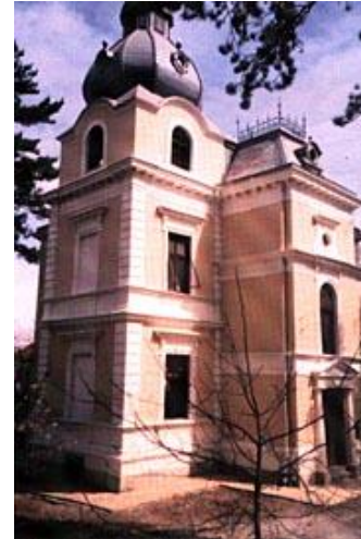
The Villa on Topcider Hill

Owing to the tremendous destruction of Belgrade during World War I the city palaces could not be used and repair took several years. Other locations had to be used as temporary Royal Palaces. A location that was used was the Krsmanovic House near Belgrade's Terazije Place and this became the residence of Prince Regent Alexander (later HM King Alexander I) in 1918 and 1919. It was in Krsmanovic House where the proclamation of the Union of the Southern Slavs into the Kingdom of the Serbs, Croats and Slovenes took place. Another small suburban villa at the foot of the Topcider Hill was used as the temporary residence of King Peter I and this is where he died in 1921.