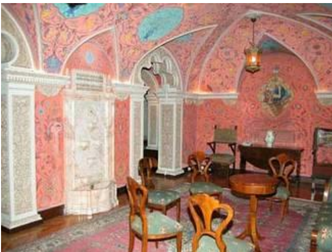
The Oriental or the Room of Whispers

The private living quarters are located on the first floor and this is where Their Royal Highnesses Crown Prince Alexander, Crown Princess Katherine, Hereditary Prince Peter, Prince Philip and Prince Alexander live. Grouped around a Central Hall these apartments are decorated in various styles, most notably Louis XVI, Empire, Napoleon III and Biedermeier. The Attic contains smaller guest apartments and ancillary rooms. The Basement is decorated in the style of the Moscow Kremlin Terem Palace, the vaults and walls are painted in the theme of the Fire-Bird Legend, as well as the motives from Serbian national epics. That is why the largest of these drawing rooms is named the Room of Miracles. The Billiard room and a cinema are also located here.