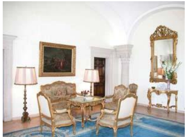
The Blue saloon of The Royal Palace

The ground floor rooms are very beautifully appointed. The Formal Entrance Hall is paved with stone and decorated with copies of medieval frescoes from the Monasteries of Dechani and Sopochani. The Blue Drawing Room is decorated in the Baroque style; the Golden Drawing Room (Palma il Vecchio) and Dining Room are in the Renaissance style with impressive wood carved ceilings and bronze chandeliers. These rooms are ornately decorated with paintings of old masters and Renaissance painted Florentine Cassoni from the Royal collections. The Library and King's Cabinet are decorated in the same manner.