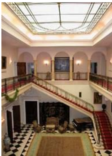
The Hall and the Gallery of The White Palace

The construction of The White Palace was started 1934 when King Alexander I was still alive and King Peter II great uncle HRH Prince Regent Paul supervised the completion of the palace. The White Palace took almost four years to finish (1934-1936) and it became the official residence on loan to the Prince Regent and his family in the waiting for King Peter II majority.