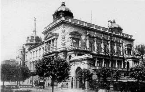
The Old Royal Palace as seen from King Milan Street prior to 1941. Today the Palace is the City Assembly of Belgrade.

The Old Palace in Belgrade was erected by King Milan Obrenovic during the period 1881-1884 (it is today Belgrade City Hall) and was the residence of King Peter I Karadjordjevic (1903-1921) and King Alexander I (1921-1922). This Palace was built in the academic style with renaissance decoration of the façades. The architect was Alexander Bugarski. The Palace was a representative building originally embellished with two cupolas topped with large gilded Royal Crowns. Since the Palace was heavily damaged in both World Wars in the last century, the cupolas are missing today and the entire appearance of The Old Palace has somewhat changed. Some parts of the Palace are demolished (for example the palace chapel),