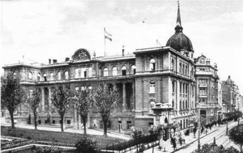
The original appearance of the New Royal Palace (It is now the Office of the President of the Republic of Serbia)

The New Palace is adjacent to the Old Palace it was built during the Balkan Wars and World War I. The architect was Stojan Titelbac. The unfinished Palace was heavily damaged during the Austrian bombing of Belgrade so that reconstruction had to take place before the court officially moved in. The New Palace was put to regular use from 1922 until the completion of The Royal Palace of Dedinje in 1929 and it was the official home of King Alexander I and Queen Maria. The New