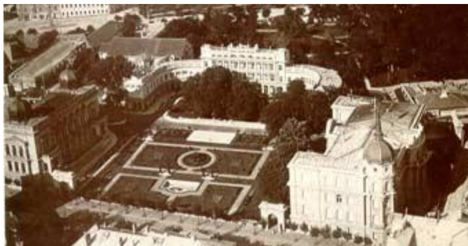
The City Palaces before the bombing of 1941: left, The Old Royal Palace, right, The New Royal Palace, in the middle Offices of the Marshal of the Royal Court and Guards premises.

The Old Palace was the official Royal residence, but it was temporarily put to other use in 1919 and 1920 by the Parliament of the Kingdom. The Old Palace was also used for official receptions and other state functions.