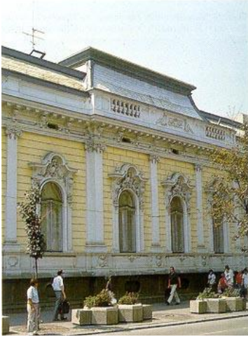
Krsmanovic House in Belgrade's Terazije Place

Owing to the tremendous destruction of Belgrade during World War I the city palaces could not be used and repair took several years. Other locations had to be used as temporary Royal Palaces. A location that was used was the Krsmanovic House near Belgrade's Terazije Place and this became the residence of Prince Regent Alexander (later HM King Alexander I) in 1918 and 1919. It was in Krsmanovic House where the proclamation of the Union of the Southern Slavs into the Kingdom of the Serbs, Croats and Slovenes took place. Another small suburban villa at the foot of the Topcider Hill was used as the temporary residence of King Peter I and this is where he died in 1921.